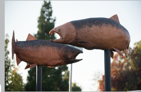
Circling Salmon, by Lucas Brinkerhoff, 2019